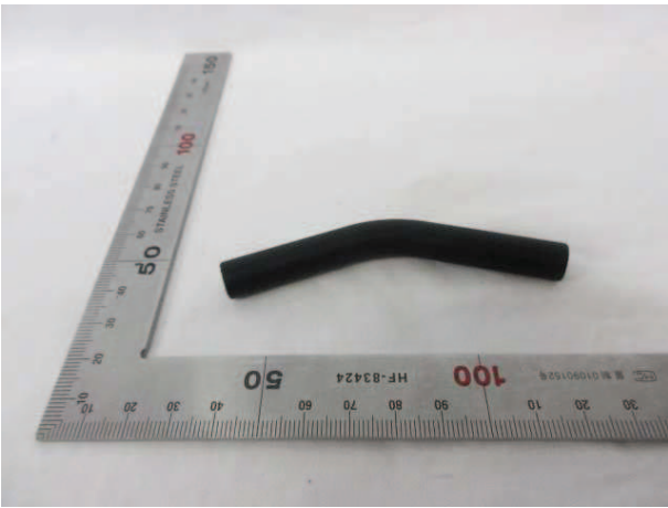
Sample No. 1