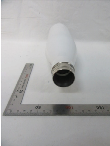
Sample No. 6